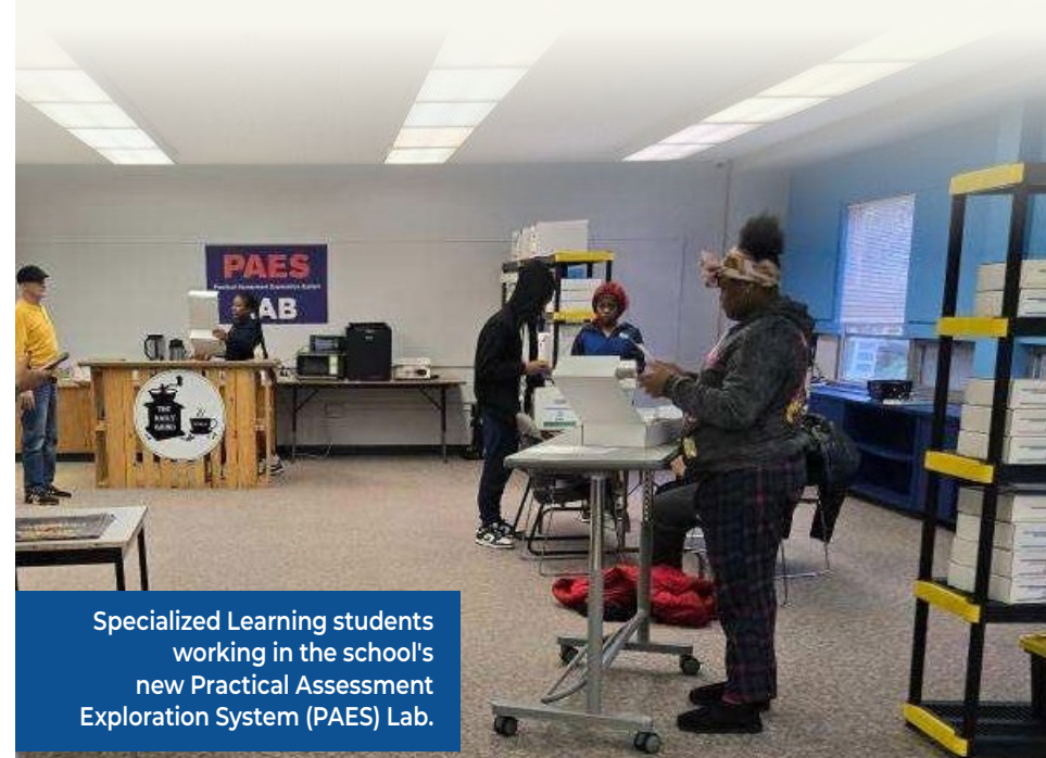
Specialized Learning students working in the school's new Practical Assessment Exploration System (PAES) Lab.