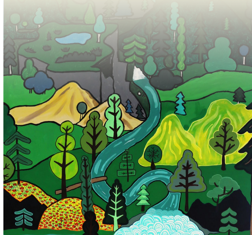
The new mural in the Holy Family Specialized Learning library.

Upgrades to the school building are only a small part of what makes Specialized Learning a comfortable space for students. The school leadership and hardworking staff provide the important support and instruction to help students reach their goals.