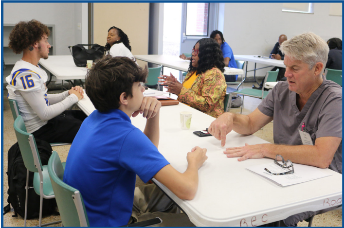
Nazareth Prep students meet their mentors for the first time at Internship Partner Orientation

Nazareth Prep offers a diverse and innovative education, and this school year is off to a strong start. The school's success depends on students, families, teachers, staff, and corporate and nonprofit partners coming together with a shared goal—creating life-changing opportunities for our community's young people.