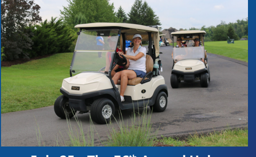
July 25 - The 36th Annual Holy Family Institute Golf Classic