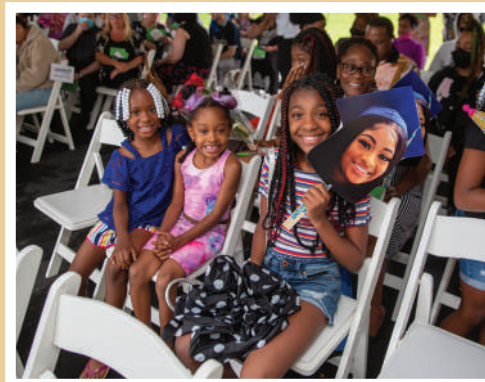
Proud family members hold cut-out sign of a graduate's face.

After sharing fond memories of food drives and basketball championships, she praised classmates for being uncomfortable with mediocrity. "We wanted more for ourselves," she said. "We found passion within our daily routine. We made connections with businesses, law firms, and hospitals. We found meaning and connection in service. And our job now is to make sure our story impacts others."