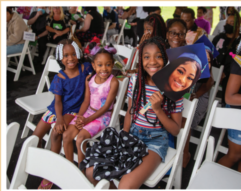
Proud family members hold cut-out sign of a graduate's face.

After sharing fond memories of food drives and basketball championships, she praised classmates for being uncomfortable with mediocrity. "We wanted more for ourselves," she said. "We found passion within our daily routine. We made connections with businesses, law firms, and hospitals. We found meaning and connection in service. And our job now is to make sure our story impacts others."